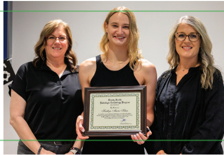
Radiologic Technology Scholarship