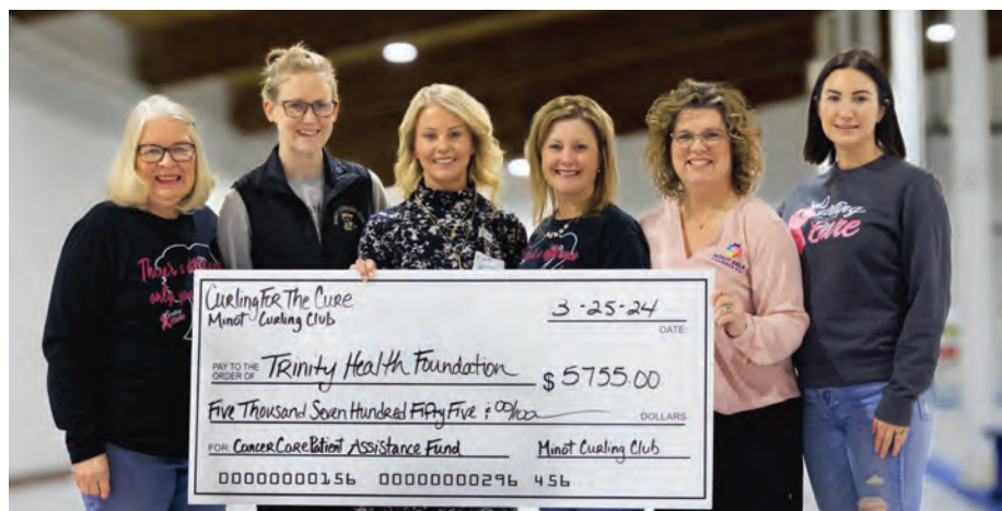
The Trinity Health Foundation was presented with a generous gift from the Minot Curling Club on March 25.