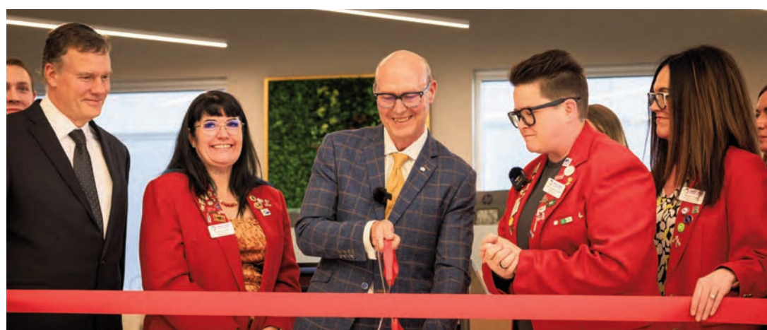
Town & Country Credit Union held a grand opening event for their new credit union location inside the Trinity Health Hospital Atrium on April 11. Members of Trinity Health Credit Union, Minot Chamber EDC and Trinity Health gathered to celebrate the occasion.