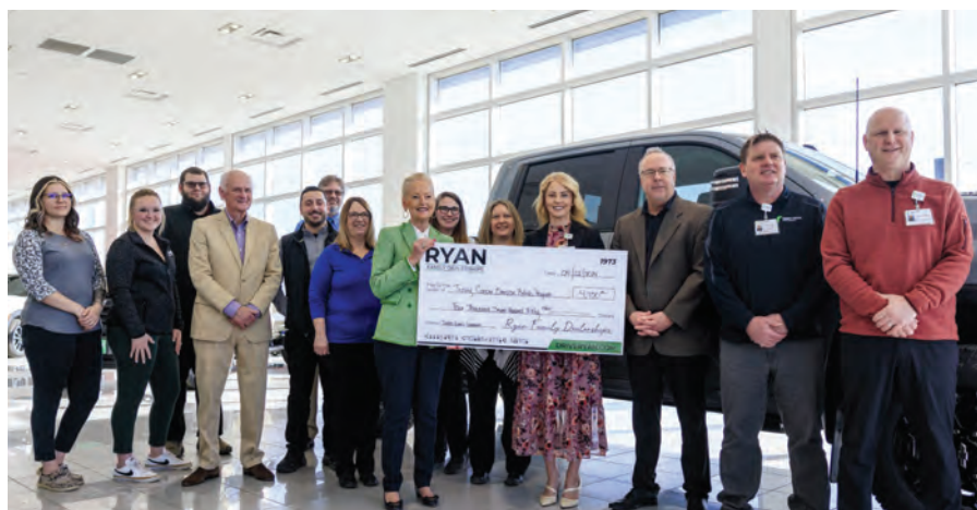
Members of Trinity Health Exercise Physiology, Cancer Care Center and Foundation accepted a generous donation from Ryan Family Dealerships on April 2.

Thank you to the Minot Curling Club for their donation to Trinity Health Foundation's CancerCare Patient Assistance Fund! Their 4th Annual "Curling for the Cure" women's bonspiel was a fundraising force – raising $5,755 in critical funds to directly support Trinity Health patients battling cancer. Thank you, Minot Curling Club! Your support makes a real difference in the lives of our patients.