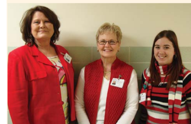
Behavioral Health, Trinity Hospital – St. Joseph's