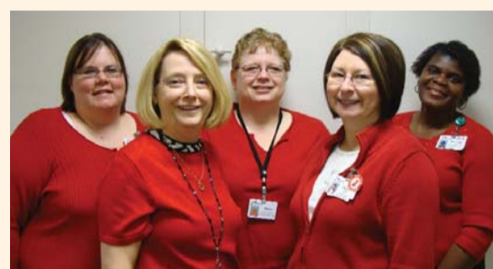
HIM, Trinity Hospital

Trinity Health employees participated in the Go Red for Women Wear Red Day on Friday, Feb. 4, in recognition of the importance of women's heart health. Heart disease is still the No. 1 killer of women age 20 and over, killing approximately one woman every minute. In fact, more women die of cardiovascular disease than the next four causes of death combined, including all forms of cancer.