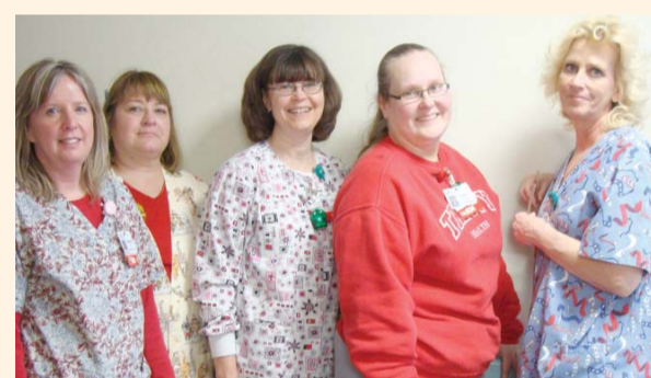
Same Day Surgery, Trinity Hospital