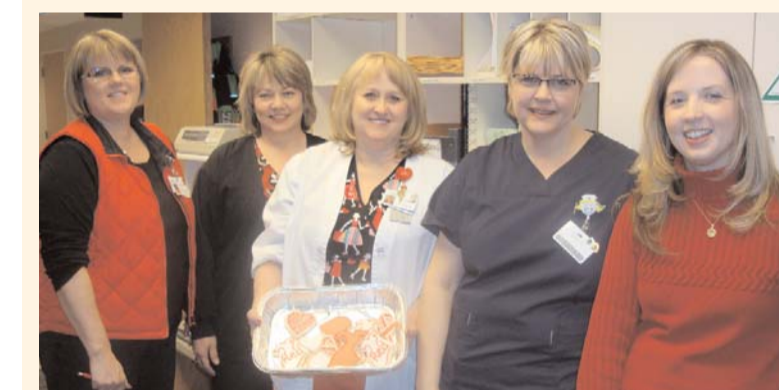
Cardiology, Health Center – Medical Arts