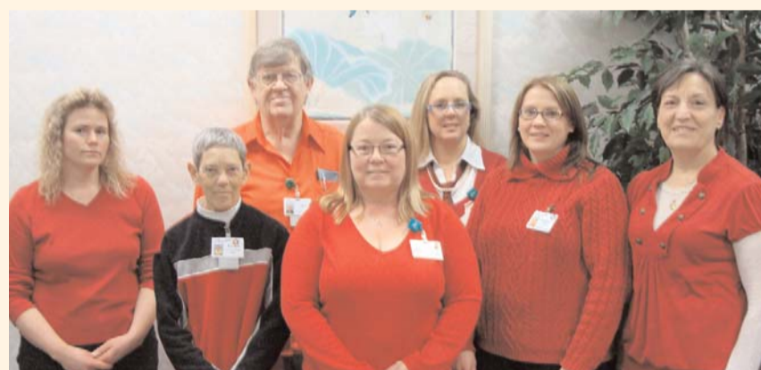
HIM, Trinity Hospital – St. Joseph's