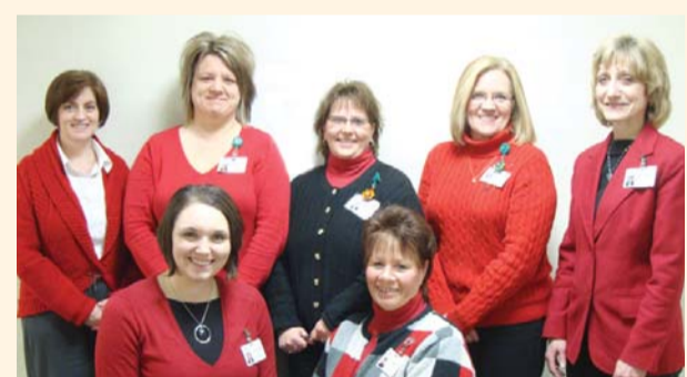
Quality Improvement and Infection Control Trinity Hospital