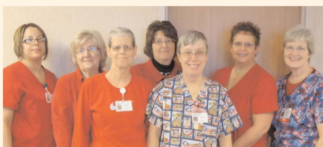
RehabCare, Trinity Hospital – St. Joseph's